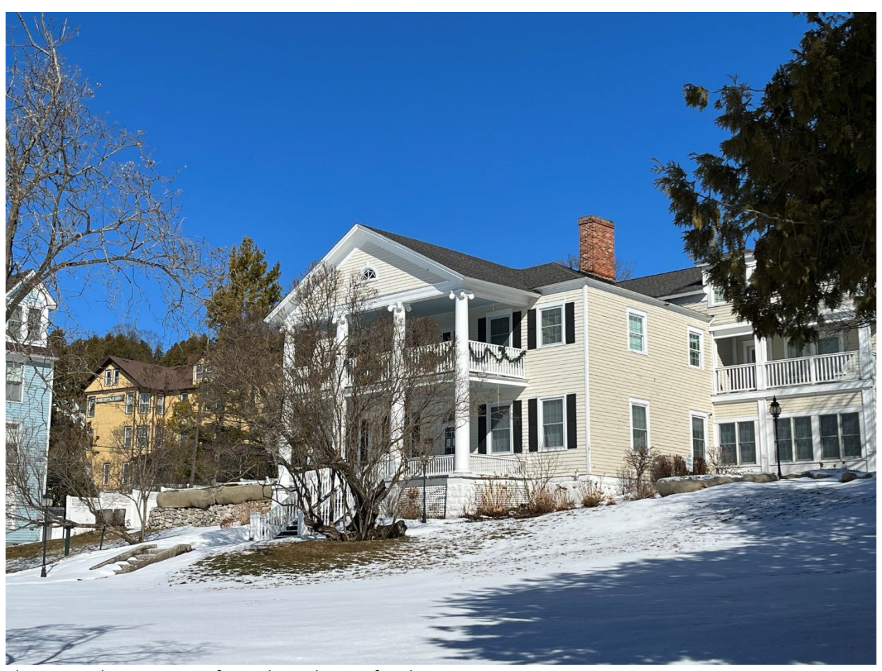
Photo 6. Harbour View Inn, formerly Madame Laframboise House, 6860 Main Street