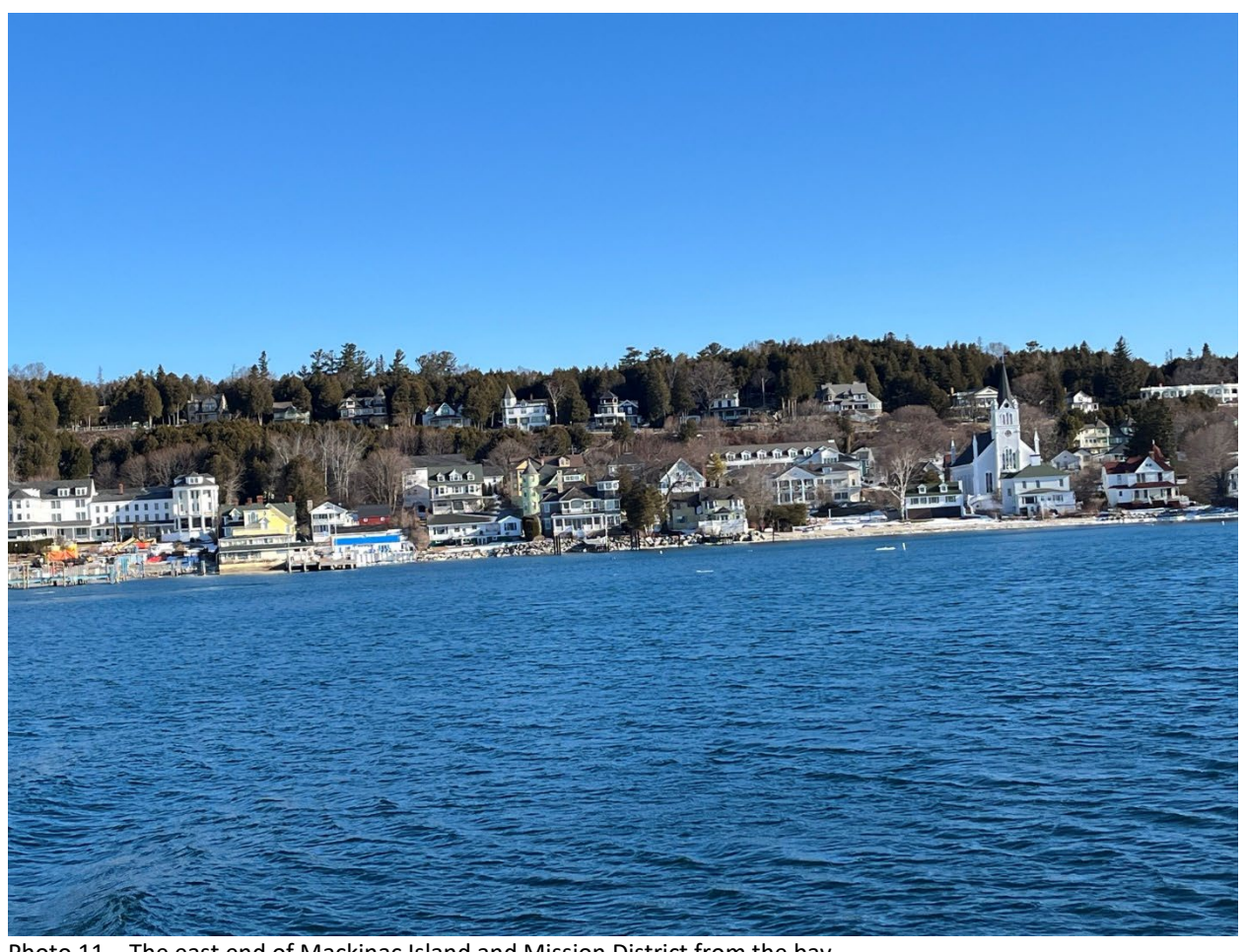
Photo 11 – The east end of Mackinac Island and Mission District from the bay.